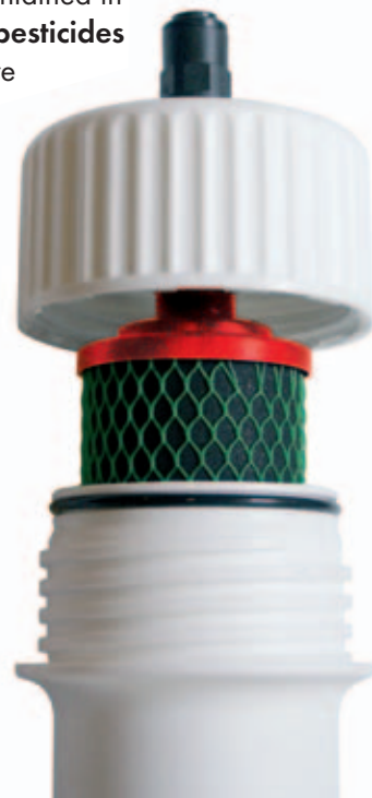
KF cartridge in slimline housing round head type (only Ø 75 mm)