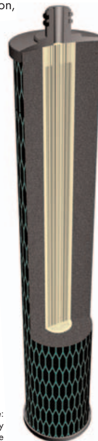
Section through an AMF cartridge: active carbon block followed by capillary membranes inside

Another application is the usage as a filter for bacteria between tap and permeate tank in combination with an under-sink reverse osmosis unit.